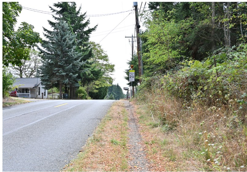
A small, 18-inch dirt path will be replaced by a 6-foot-wide sidewalk to improve pedestrian safety before the next school year.

The project is listed in the six-year Capital Improvement Program, and the