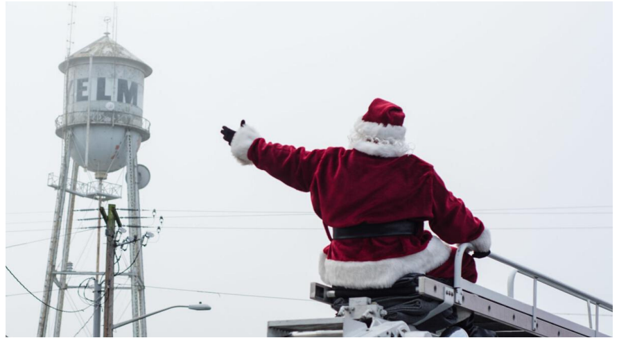
The parade begins at 9:30 a.m. at Yelm Cinemas and will run along Yelm Avenue to the Yelm City Park.